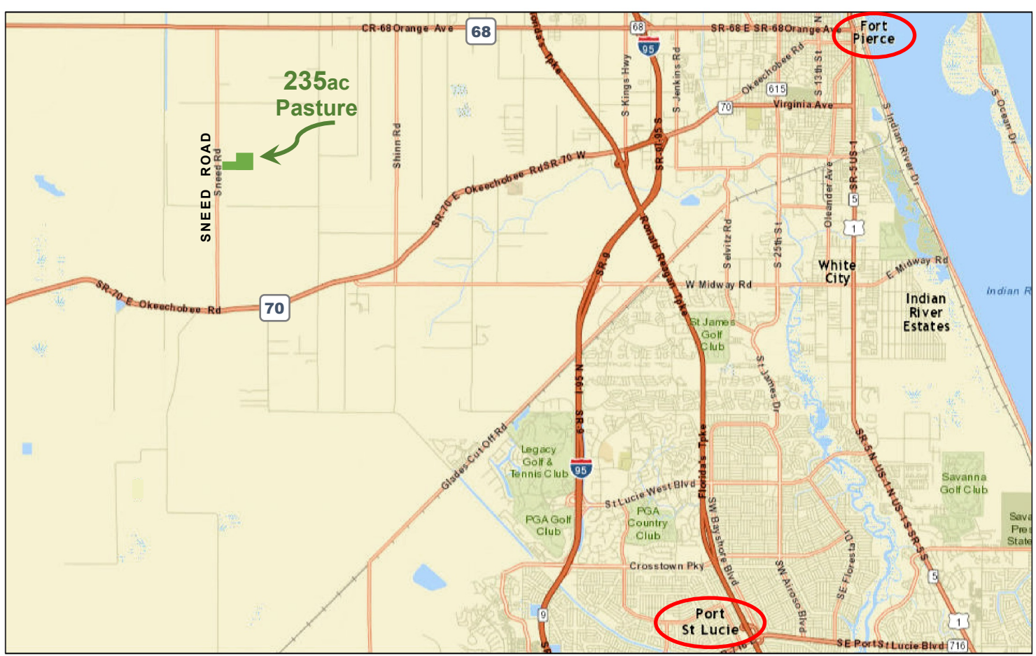
<u>From I-95:</u> From Exit #131 at Orange Ave / SR 68, go west approximately 8.3mi to Sneed Rd, then turn left & go south 2.5mi to Property and sign on left.